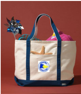
Natural with trim: Navy, Red, Royal, Hunter, Black, Pink Boat name embroidery extra