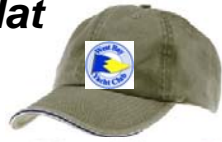
Olive Khaki, Stone, Navy, Red